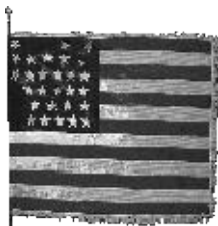
(4 th Michigan Infantry Battle Flag)